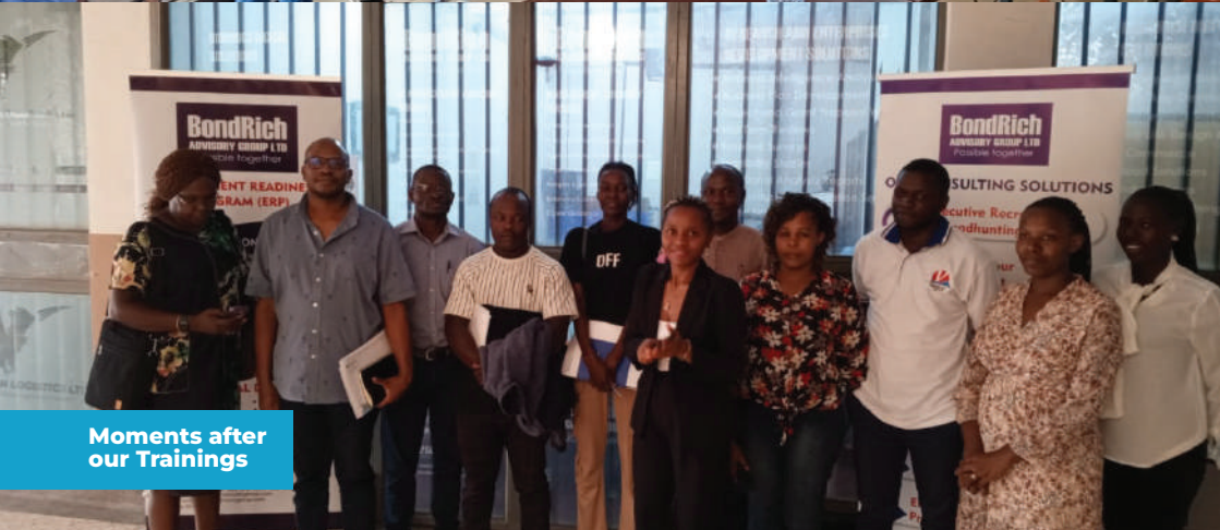
Moments after our Trainings