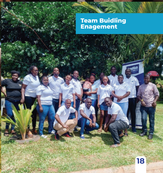
Team Building Engagement